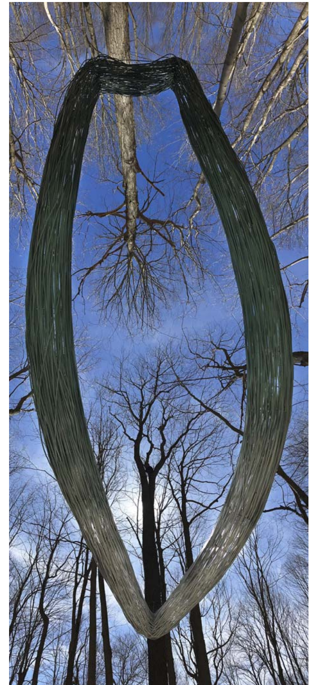
Floating Taiwan - WenFu Yu Aluminum tube, spray-painted