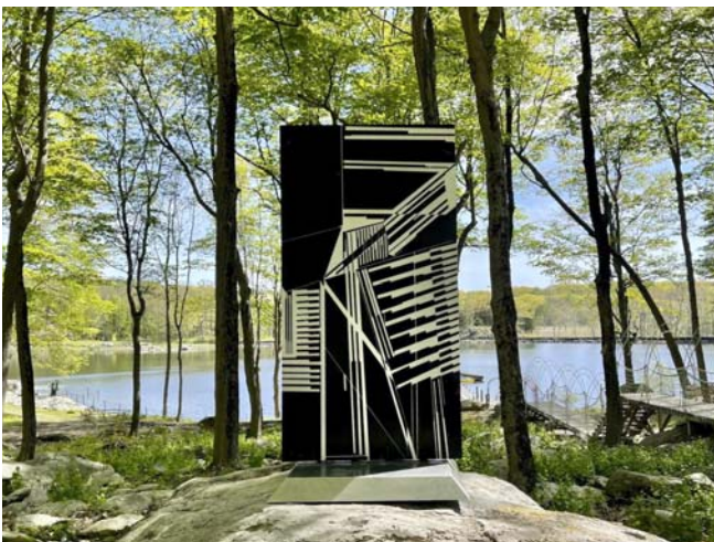
Moon Marker - Vargas-Suarez Universal Unique powder coated stainless steel