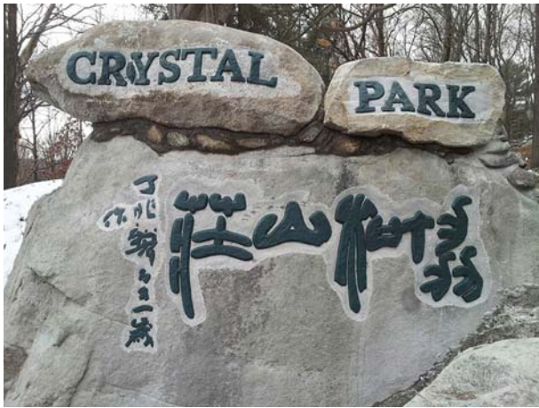
Crystal Park 協和山莊 Stone carving Chinese calligraphy by Ding Zhaolin 丁兆麟