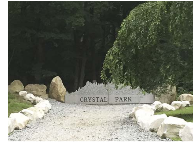
Main gate Stainless steel designed by Chiehping Chen