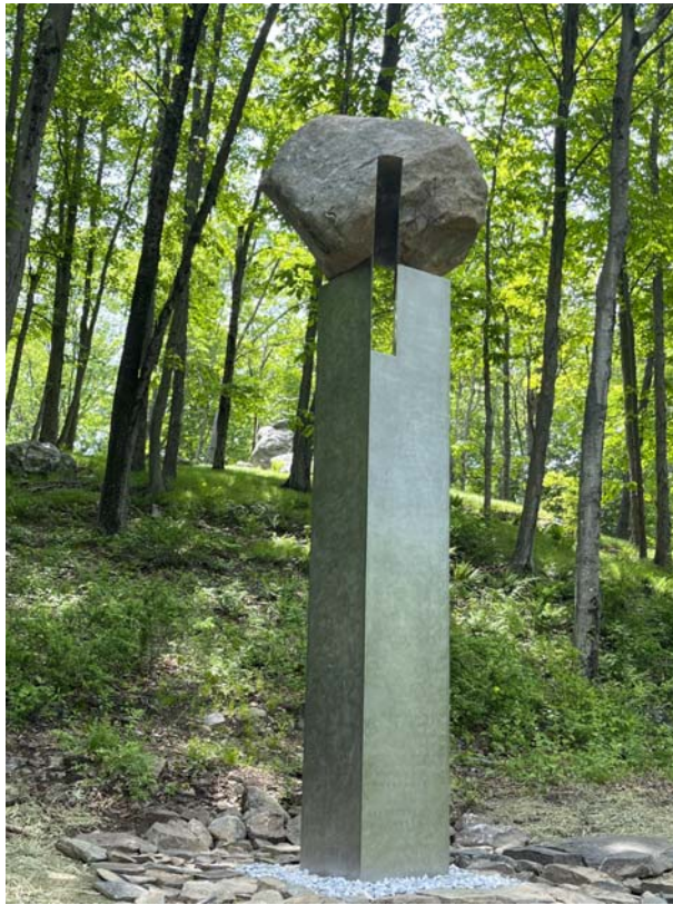
Elevated Boulder - Roland Gebhardt Steel, stainless steel, boulder from Crystal Park