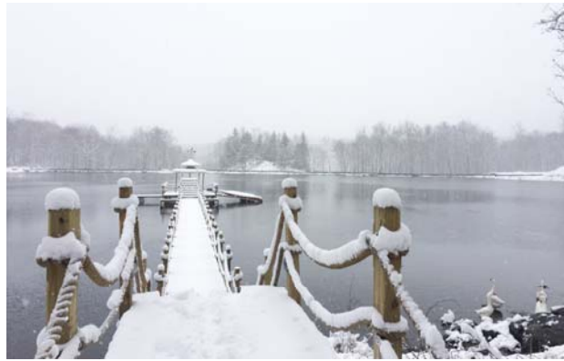
『銀源湖』 YinYuan Lake

In 2010, Crystal Park was founded in Pawling, NY. Many Crystal employees have helped in the development and establishment of trails and facilities throughout the park. Future plans include gardens, farming areas, artist studio spaces, an art museum and the commission of outdoor sculptures by Taiwanese and international artists.