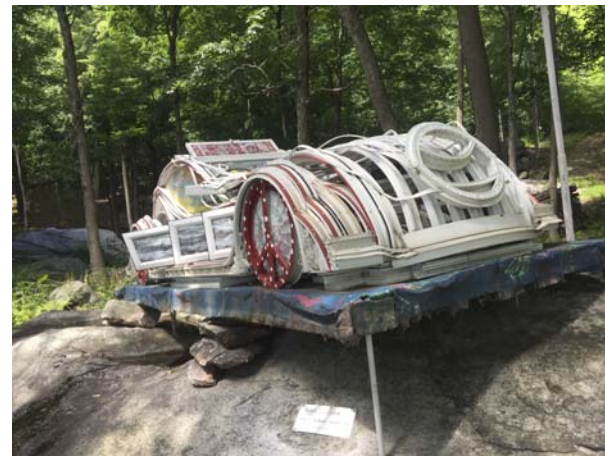
Sun in Action - Lin Shih Pao Recycled vinyl window, recycled wood