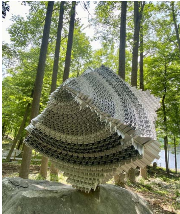
Whirling Windows Into Nature Gabriel Gaffney Smith Vinyl and aluminum window profiles from Crystal Window & Door Systems