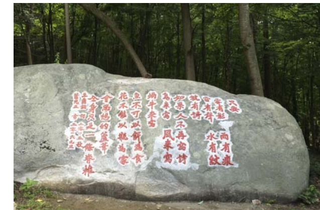
Poems for Crystal Park by Tingchian Wang Calligraphy by James Shau Stone carving

Chen was inspired by the mountains that extend north-south across Taiwan. This design represents the cross section of the mountains in Taiwan. The left side is the northern end of Taiwan, Shimen District. The right side is the most southern end of Taiwan, Kenting.