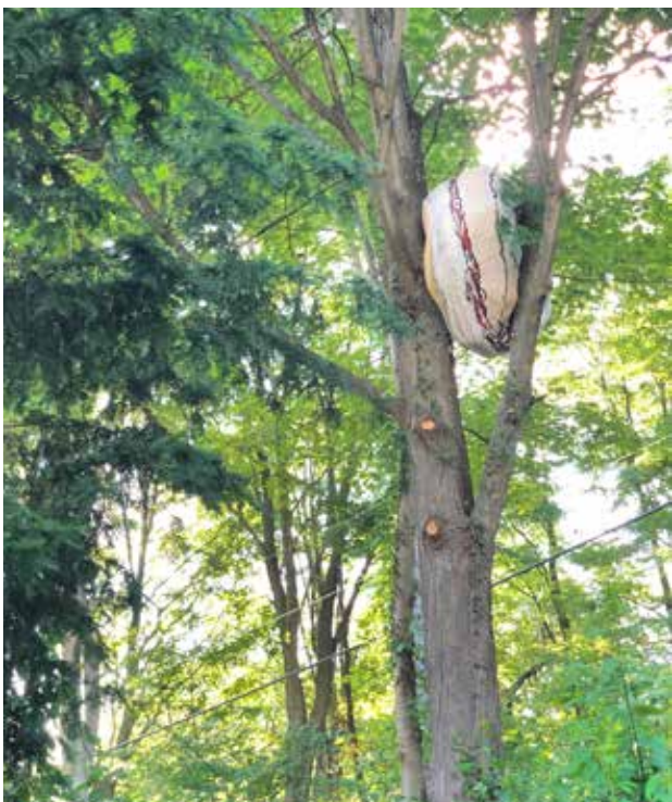
Fable - Andy Moerlein Styrofoam, polyurethane polyurea, house paint