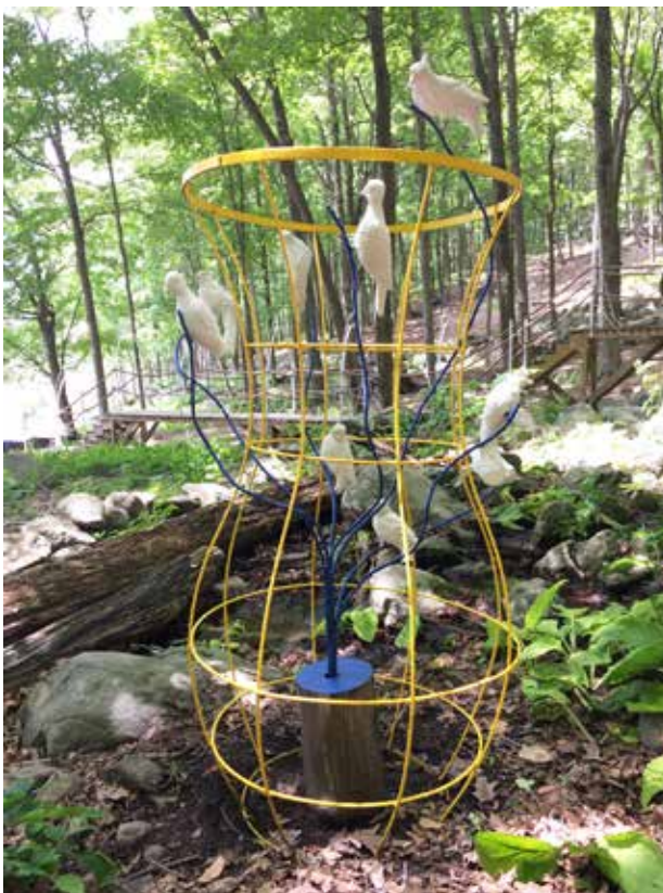
Locus Amoenus - Roberley Bell Steel frames, plaster birds and wood tree trunk bases