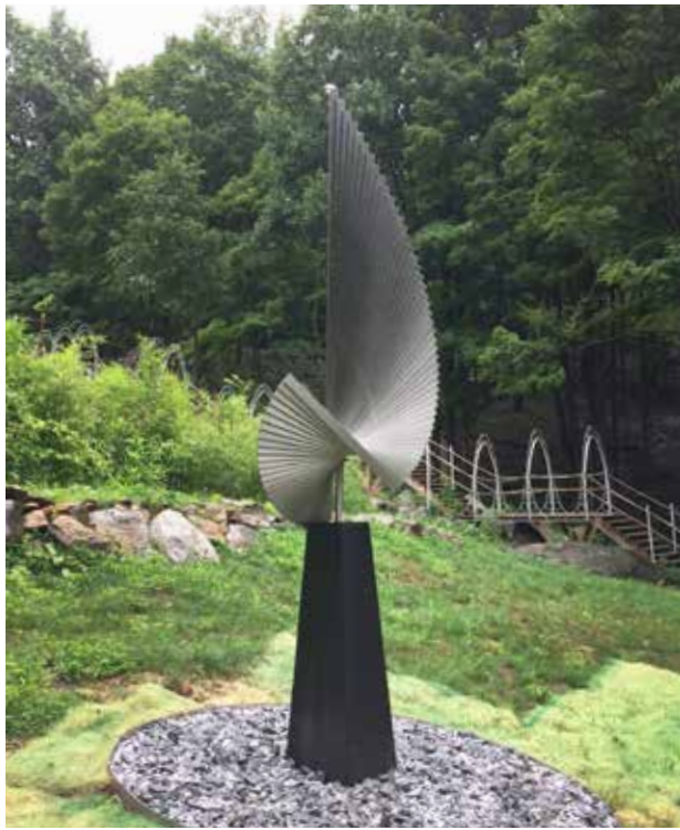
Aurora Polaris - Thomas Joynes Stainless Steel