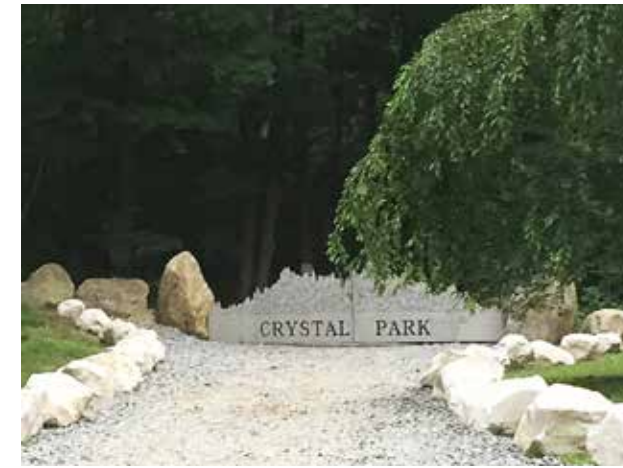
Main gate Stainless steel designed by Chiehping Chen