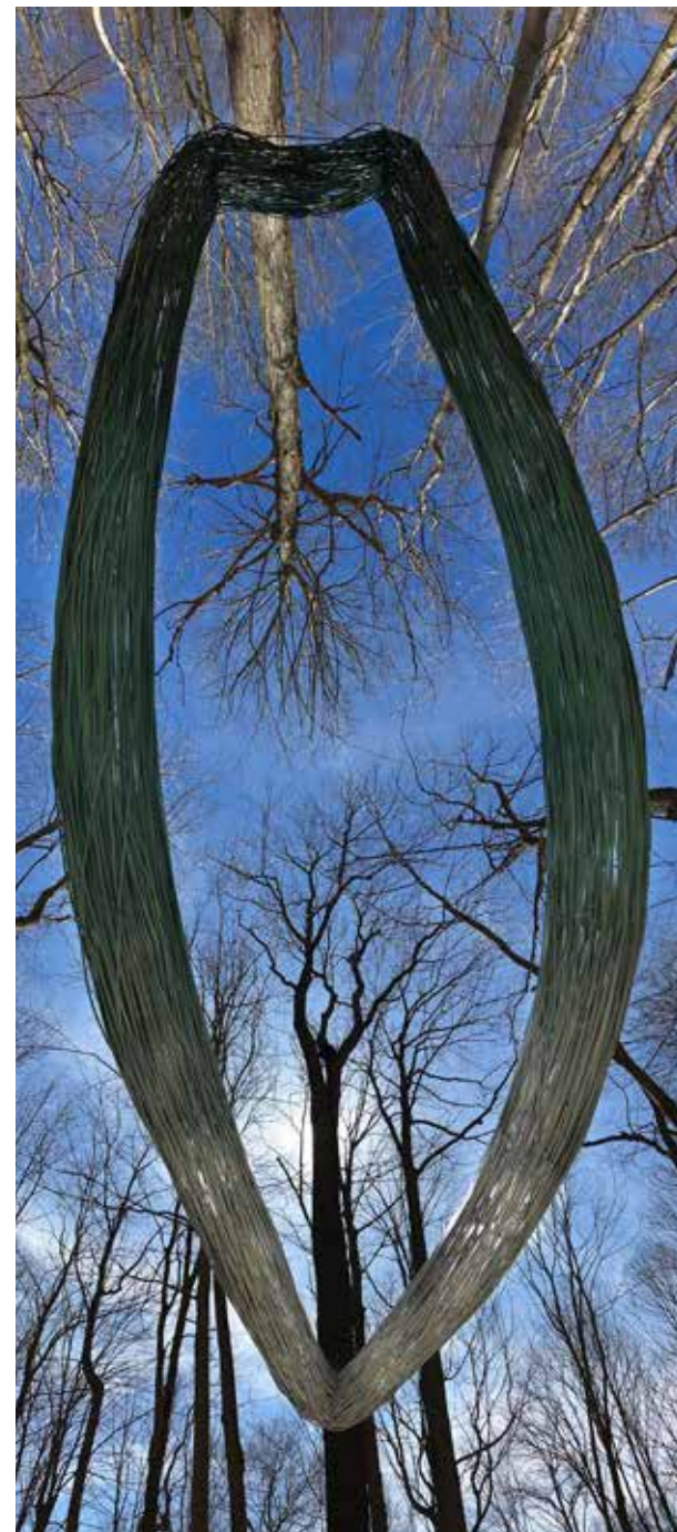
Floating Taiwan - WenFu Yu Aluminum tube, spray-painted