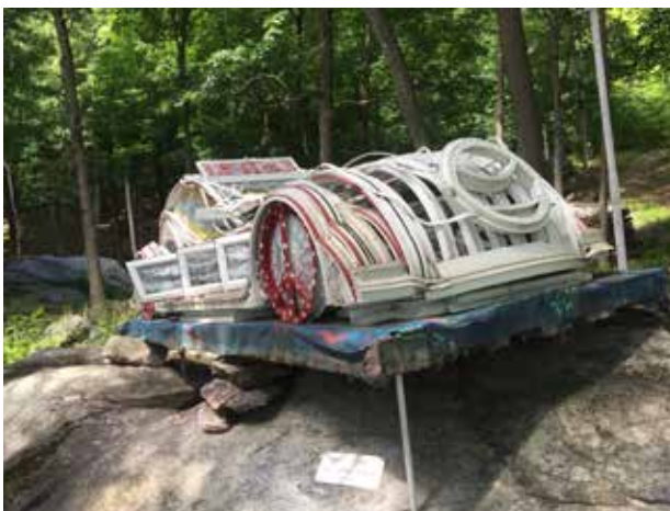
Sun in Action - Lin Shih Pao Recycled vinyl window, recycled wood