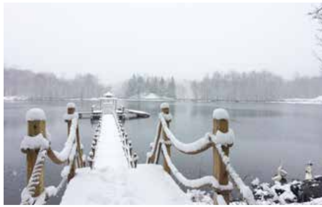
『銀源湖』 YinYuan Lake

In 2010, Crystal Park was founded in Pawling, NY. Many Crystal employees have helped in the development and establishment of trails and facilities throughout the park. Future plans include gardens, farming areas, artist studio spaces, an art museum and the commission of outdoor sculptures by Taiwanese and international artists.