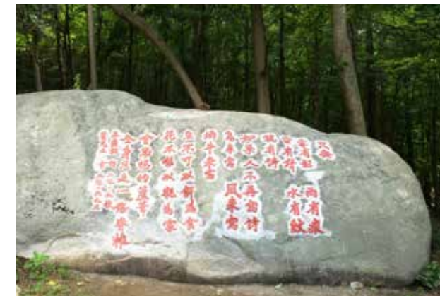
Poems for Crystal Park by Tingchian Wang Calligraphy by James Shau

Chen was inspired by the mountains that extend north-south across Taiwan. This design represents the cross section of the mountains in Taiwan. The left side is the northern end of Taiwan, Shimen District. The right side is the most southern end of Taiwan, Kenting.