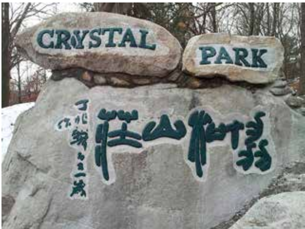
Crystal Park 協和山莊 Stone carving Chinese calligraphy by Ding Zhaolin 丁兆麟